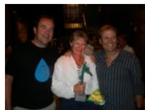
The 'Green Dragon' awarded at the gala event 'Homage to the Defenders of Rivers and Life', Zaragoza.