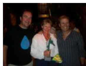
The 'Green Dragon' awarded at the gala event 'Homage to the Defenders of Rivers and Life', Zaragoza.