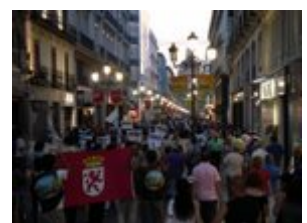
Rally of 1000s determined to stop building, or raising walls and calls to decommission dams. .