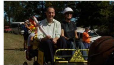
in a horse-drawn cart