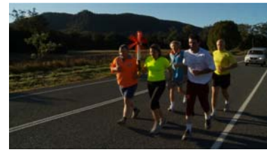
running with the torch