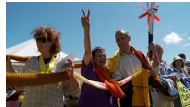
passing the torch along the human chain