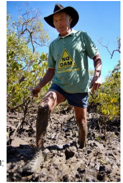
Above: South and North Mary River heads; Right: putting the mud into Mary Mud Marathon; and below the 81km circuit he ran.