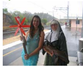
collecting the torch

With spirits souring, the torch led a convoy of bus and cars north west to the Paradise dam on the Burnett River. Several features about the Paradise dam alarm Mary River campaigners.