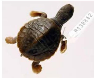
“TESS” the MARY RIVER TURTLE