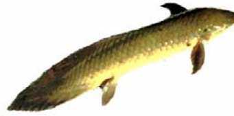
“WHEEZER” the LUNGFISH