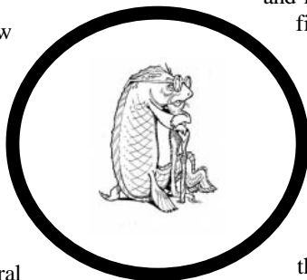
"WHEEZER" the WISE LUNG-FISH is 300 million years old

The Mary River Cod relies on deep, cool, shaded pools containing large woody debris (snags) for it to successfully breed. The Traveston dam will flood several of these known habitats on the Mary River and will not provide any similar habitat once completed.