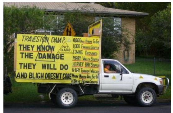
One of the many unique Save the Mary utes, and some of the group gathered en route.

Campaigners were struck by how many people in Brisbane that think the dam was cancelled, despite Anna Bligh being full steam ahead with the approval process.